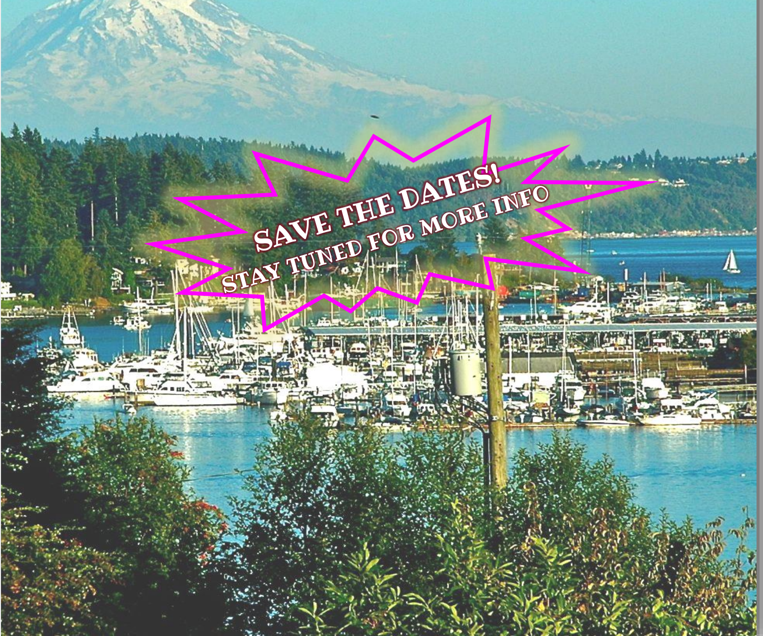
Photo of Mt Rainier, as seen from Gig Harbor, Washington. Named in 1792 by Captain George Vancouver for Rear Admiral Peter Rainier, both of the British Royal Navy. Rainier never saw any of North America beyond the eastern seaboard, during the Revolutionary War. So if you hear locals say, "THE MOUNTAIN IS OUT," you can be certain they are speaking of Tahoma, "the mother of all waters," just as in this photo of her.

In the shadow of its namesake: Mt. Tahoma, Frontier Park, Graham, WA